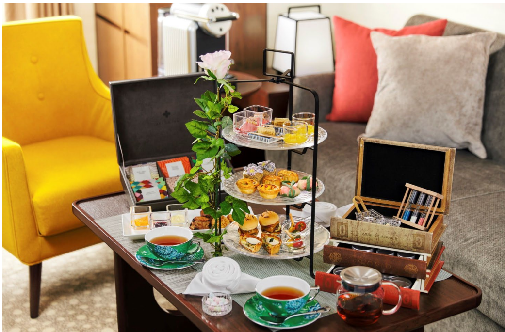
Afternoon tea in the living room of the junior suite * The photo is for 2 people

Throughout the year, beginning on April 15th (Fri.), 2022, Shiba Park Hotel is selling an accommodation plan limited to one day and three rooms, where you will enjoy an afternoon tea as part of your room service. In the private space of a guest room, you can enjoy an afternoon tea to your heart's content without worrying about the eyes of those around you. You can also bring any of the 1,500 volumes of books in the building to your room.