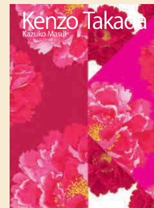
高田賢三 Kenzo Takada

出版社：Akio Nagasawa Publishing / アキオナガサワパブリッシング