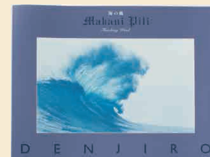
海の風 Makani Pili Touching Wind