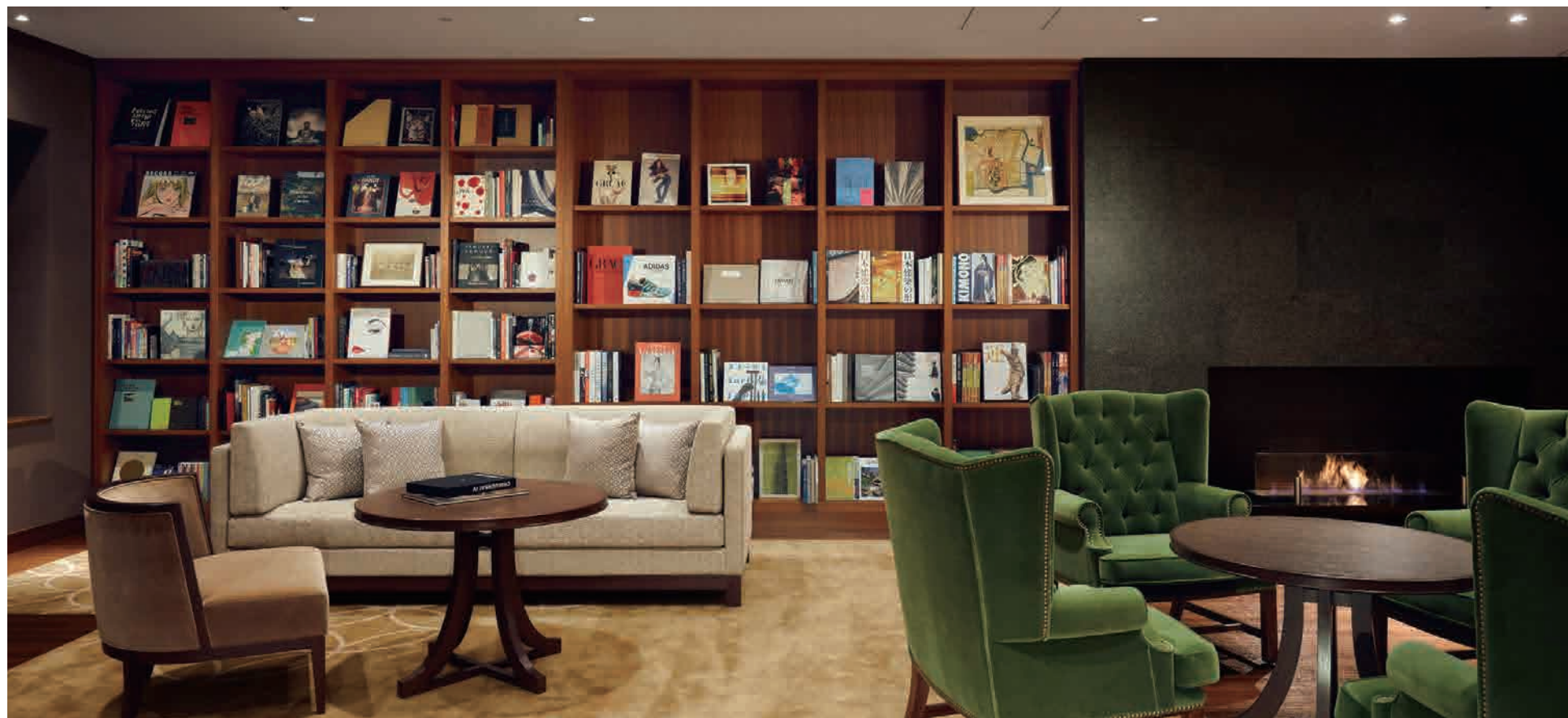
Hotel collection of 1,500 books