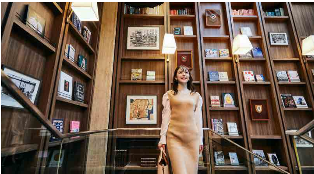
Central staircase 1st-2nd floor