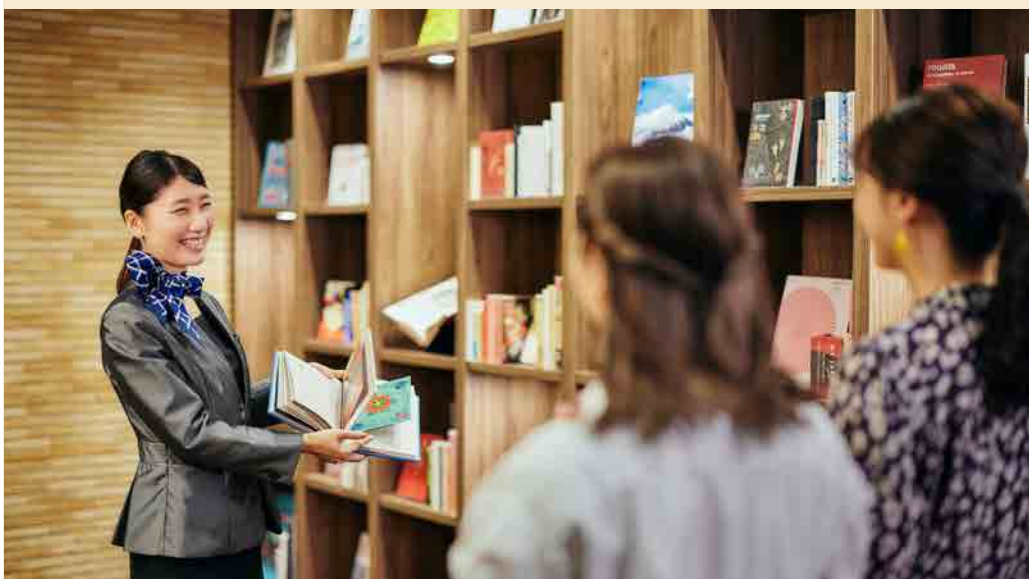
Foyer -Book & Culture- 2nd floor

In the Edo period, it was the place where the school dormitory of Zoujoji was located, and while inheriting the feelings (DNA) of the land and valuing "universal beauty", we will create a better and more prosperous future that is modern and sustainable. It is a space that expresses the "past," "present," and "future." There is a large bookshelf with a height of about 7m installed around the stairs that go up from the first floor to the banquet floor. You can also pick up a book while climbing the stairs.