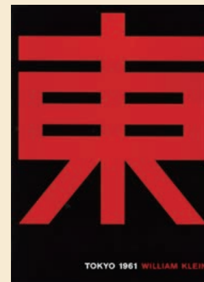
東京（都市四部作）TOKYO 写真家：William Klein / ウィリアム・クライン 出版社：Akio Nagasawa Publishing / アキオナガサワパブリッシング