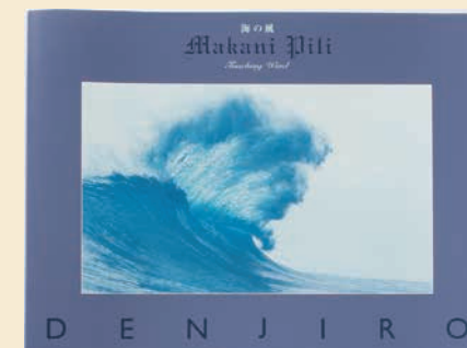
海の風 Makani Pili Touching Wind 著者：佐藤傳次郎 / DENJIRO 発行：ブエノ！ボックス / Bueno!Books