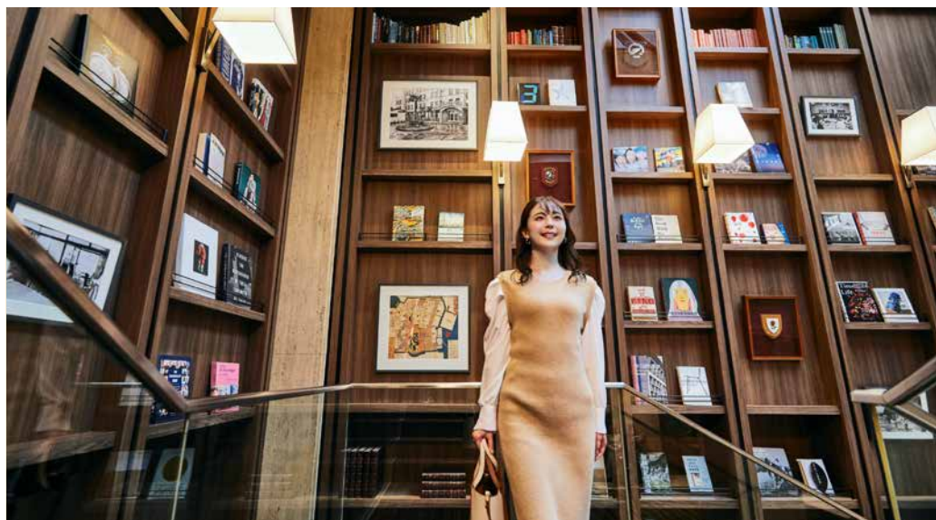
Central staircase 1st-2nd floor