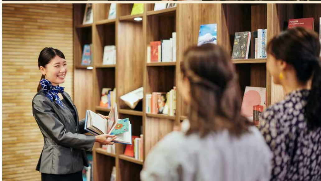
Foyer -Book & Culture- 2nd floor

In the Edo period, it was the place where the school dormitory of Zoujoji was located, and while inheriting the feelings (DNA) of the land and valuing "universal beauty", we will create a better and more prosperous future that is modern and sustainable. It is a space that expresses the "past," "present," and "future." There is a large bookshelf with a height of about 7m installed around the stairs that go up from the first floor to the banquet floor. You can also pick up a book while climbing the stairs.