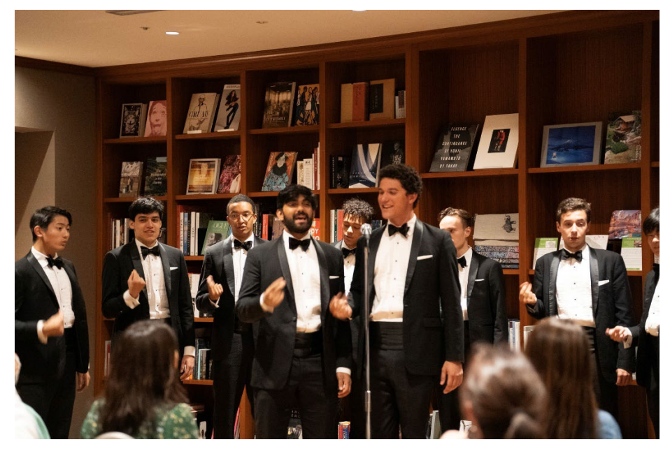
Captivating melodies by The Harvard Krokodiloes at Shiba Park Hotel, 2024

Join us for an exclusive evening where music inspires, tradition thrives, and generosity makes a difference.