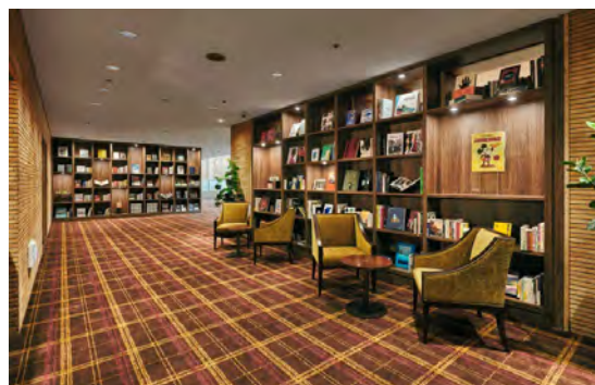
Foyer -Book & Culture-