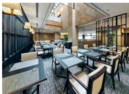
Restaurant "The Dining"