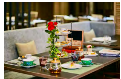
Blissful afternoon tea

Once of the highlights at The Dining is the Blissful Afternoon Tea. Guests are welcome to browse a collection of over 1,50 books while enjoying their favorite blend of black tea. Accompanied by sweets inspired by Japanese, Western, and Chinese cuisines, the experience offers a moment of peaceful indulgence.